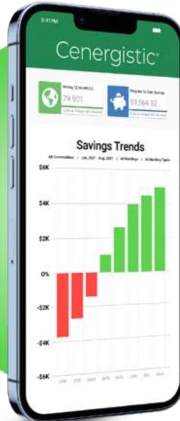
Cenergistic Optimize® Technology