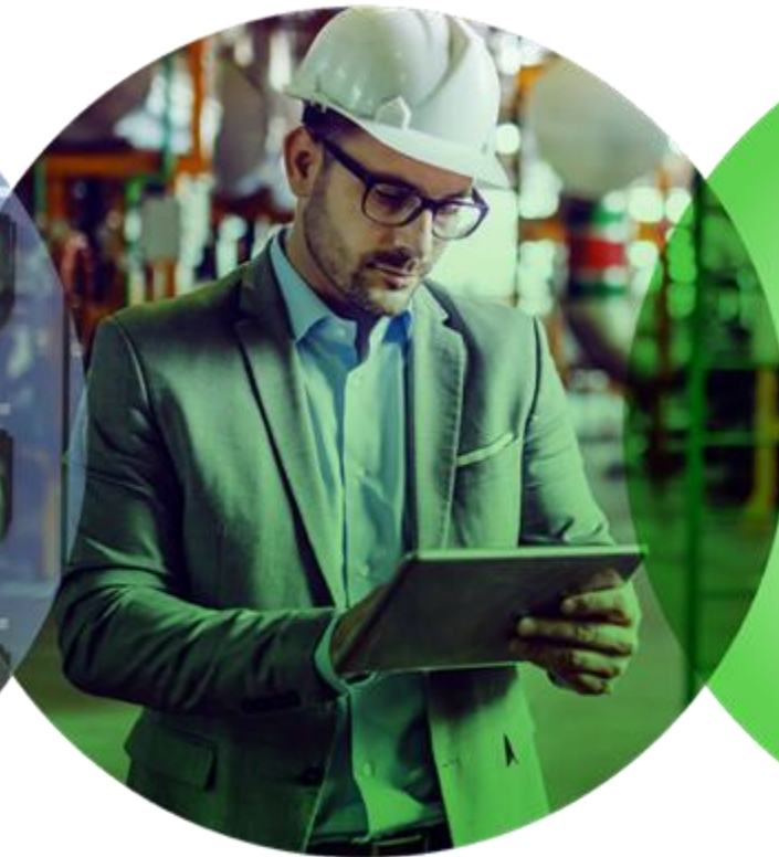
Cenergistic On-site Staff